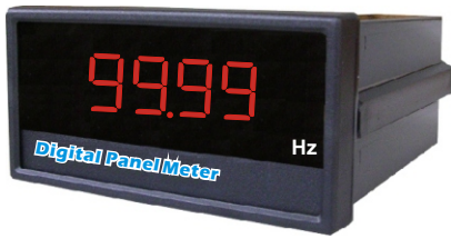
FP - 40 4 digits Frequency Meter